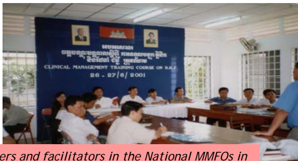
Participants, trainers and facilitators in the National MMFOs in Cambodia, Laos, Myanmar and Philippines

Four national MMFO courses were conducted during the last quarter of 2003 and 1st quarter of 2004. Trainings held in Laos, Cambodia and Myanmar were supported by USAID while the Philippine course was co-funded by RBM/WR-Phil and AUSAID ADS-MCP Project. WHO country offices provided the needed technical assistance in running the courses while ACTMalaria alumni were tapped as facilitators. Technical resources were not only from the NMCP but lecturers were also invited from the academe and research institutions from the countries and as well as available technical consultants.