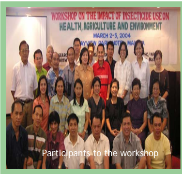
Participants to the workshop

insecticides in the country. The workshop started with the presentation of FPA mandates and regulatory procedure (National, Provincial and municipal level) and the current and future insecticide needs in Agriculture (Dept. of Agriculture) and in Public Health (Department of Health). Insecticide Environmental Concerns from Department of Environment and Natural Resources and Insecticide Poisoning from the Poison Control Department was also tackled. Capability could be strengthened with the knowledge of existing regulatory mechanisms.