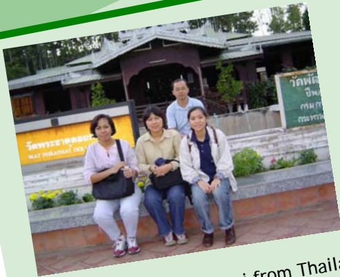
Time-out with TTT Alumni from Thailand