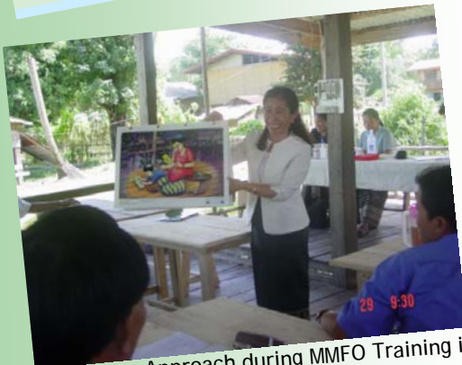
Participatory Approach during MMFO Training in Borikhamxay, Laos