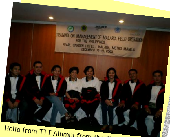
Hello from TTT Alumni from the Philippines